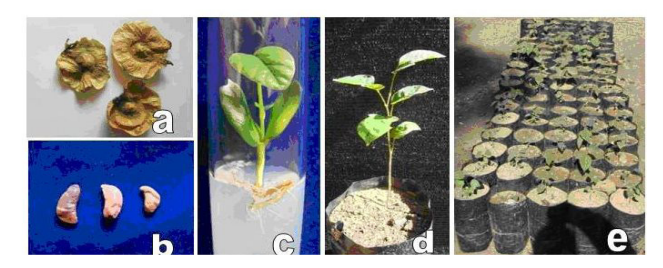
Fig. 1. In vitro seed germination of Pterocarpus marsupium (a) seed pods with orbicular wing; (b) true seeds excised from the pod; (c) seedling emerged from seed inoculated in horizontal orientation; (d) seedling transferred to polythene bag (e) seedling maintained in polythene bags in the nursery

pericarp with orbicular wing (Fig 1a). The wing of the pod was cut with sciossors and the seed inside the pod was excised with the help of scalpel (Fig 1 b). The seeds were first washed with distlled water for five minutes followed by washing with aqueous solution of cetrimide (1:10 v/v) for five minutes. Finally seeds were washed with mercuric chloride solution for 5 minutes before inoculation.