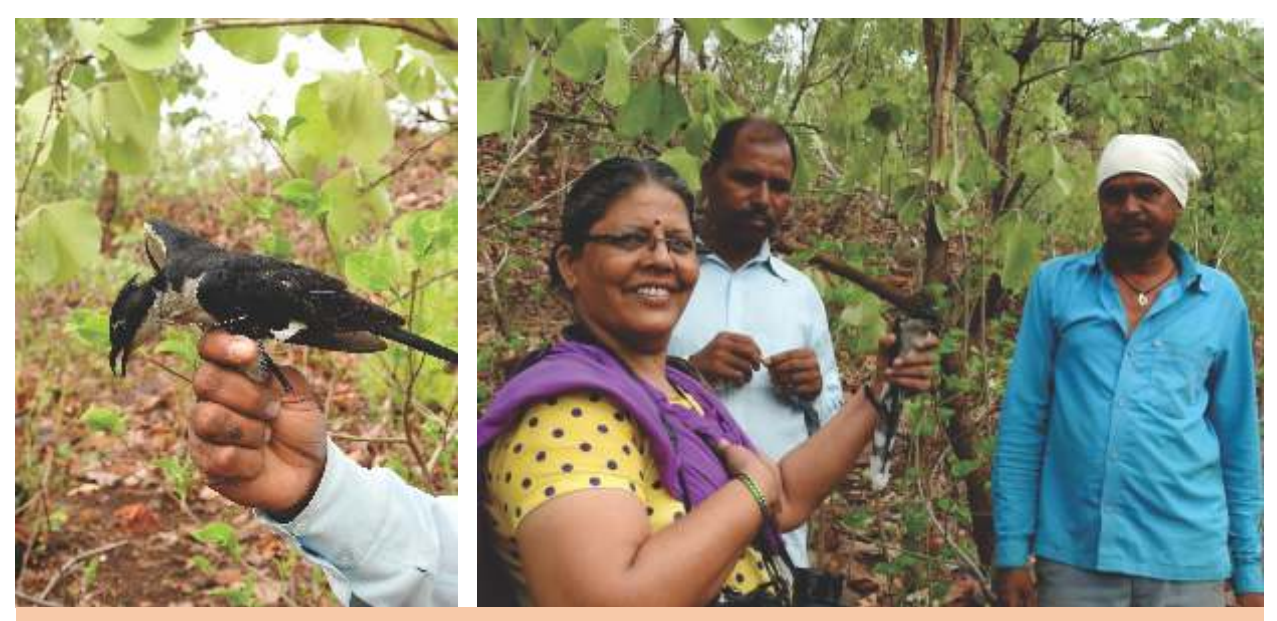
चातकाच्या सुटकेचा क्षण

पावसाळ्यात फिरण्याचा आमचा हट्ट सत्कारणी लागल्याचा आम्हा सर्वांना नक्कीच आनंद आहे.